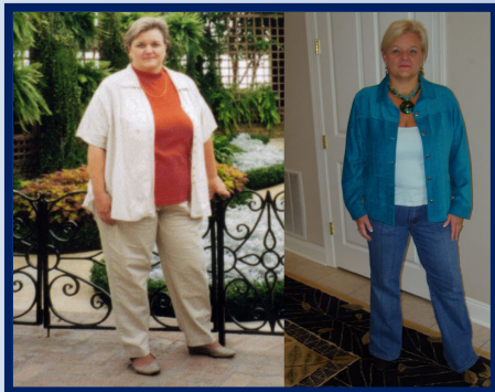
LOST 63 lbs and 7% body fat (7 months)