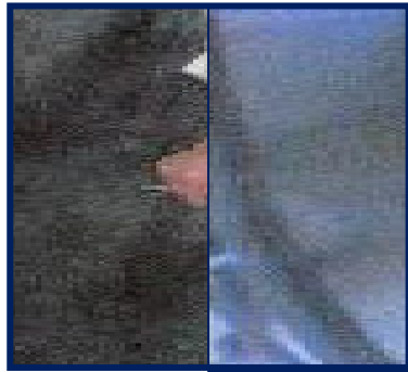
LOST 40 lbs and 10% body fat (8 months)